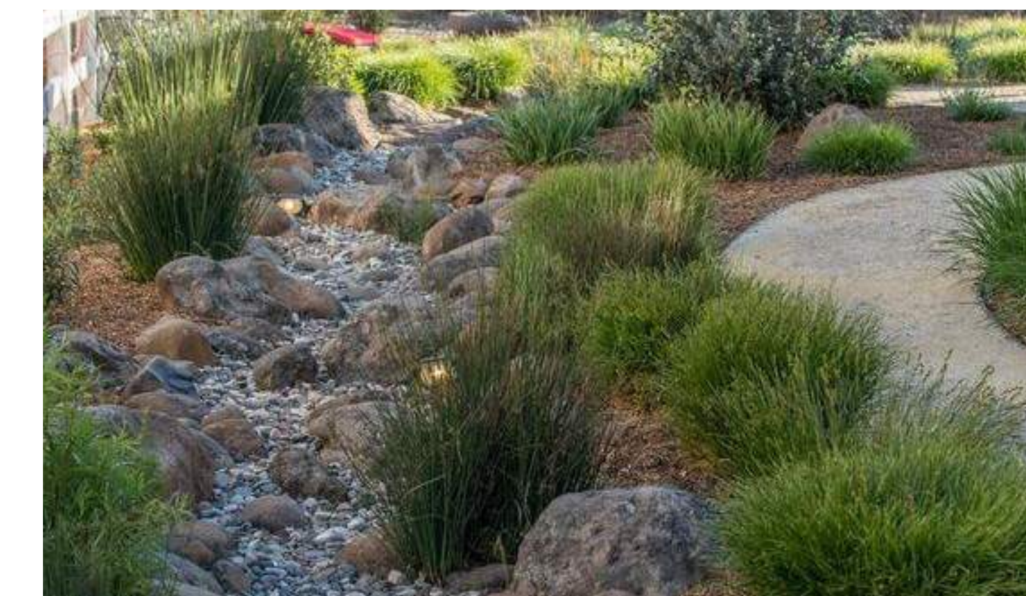
DRY CREEK BED