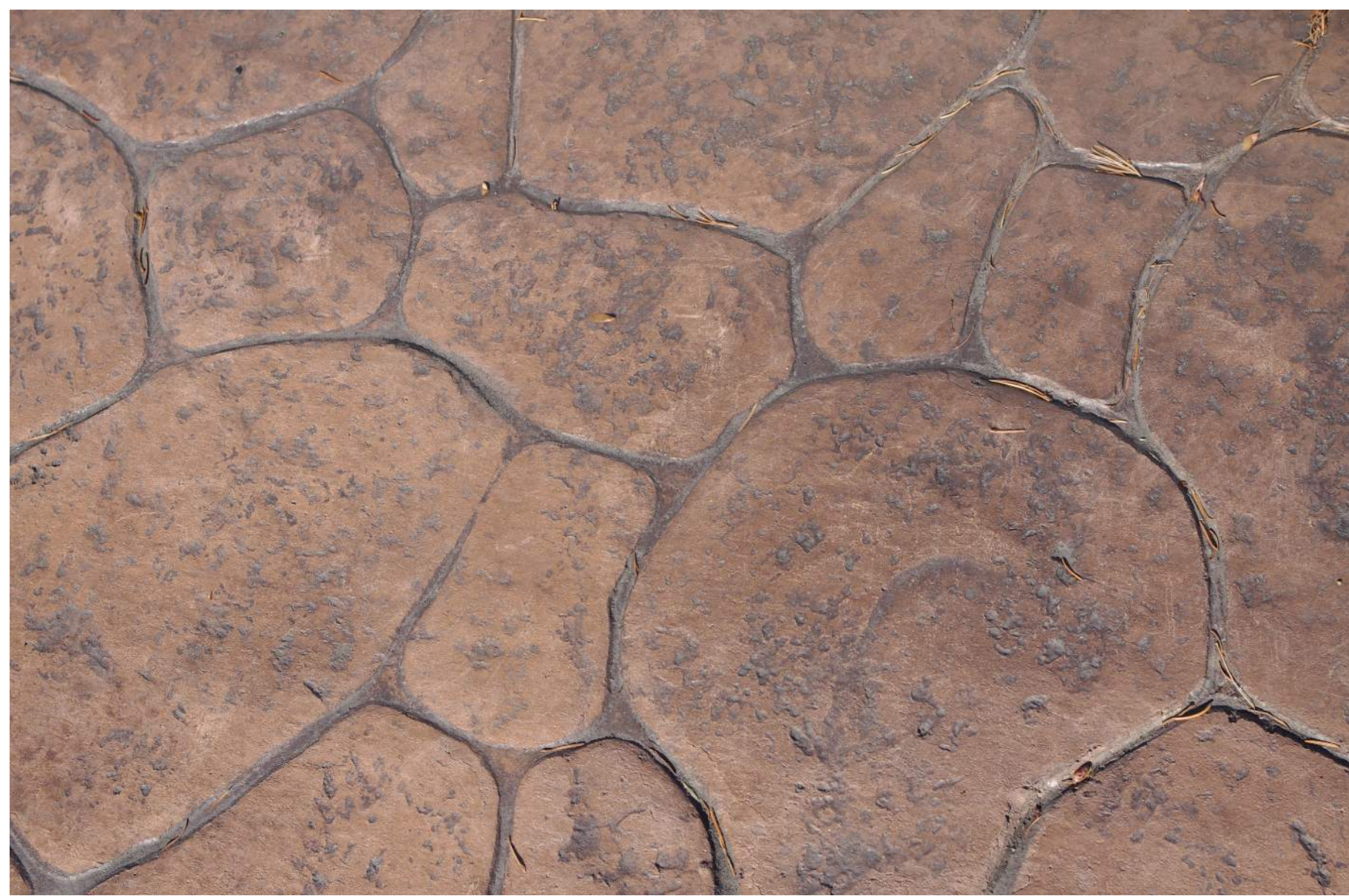
ROUNABOUT TRUCK APRON - STAMPED COLOR CONCRETE