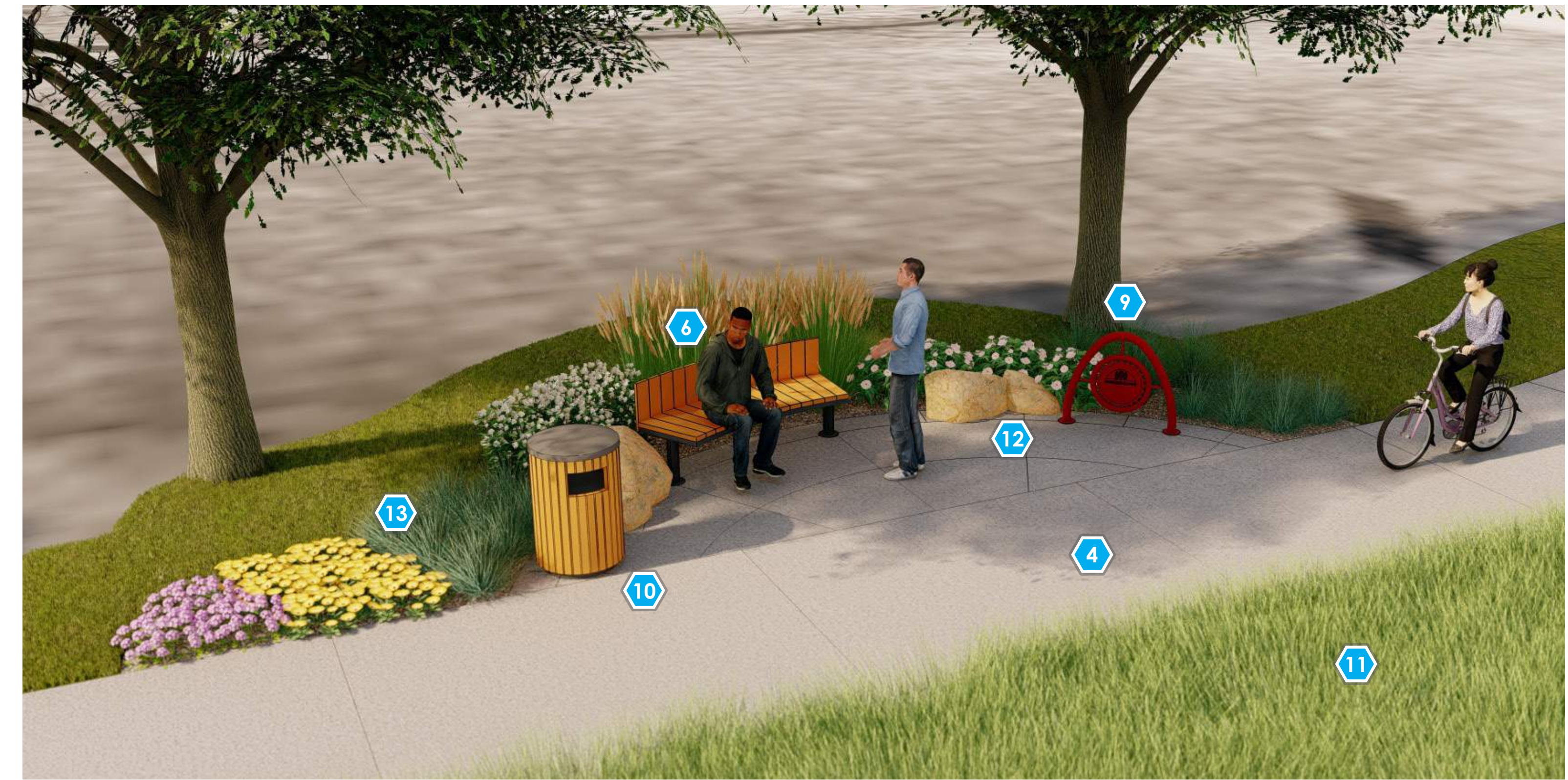
TRAIL REST AREA