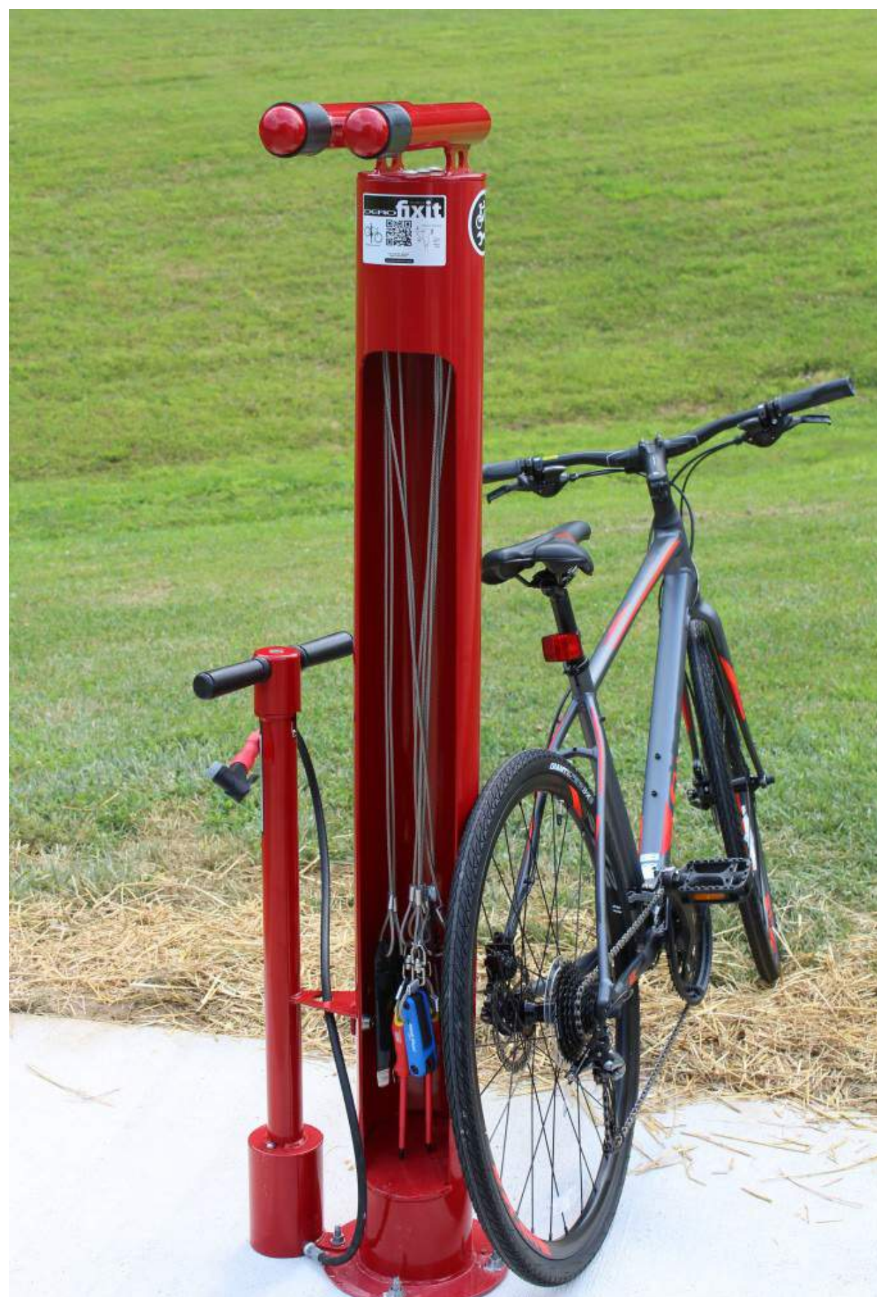
BICYCLE REPAIR STATION