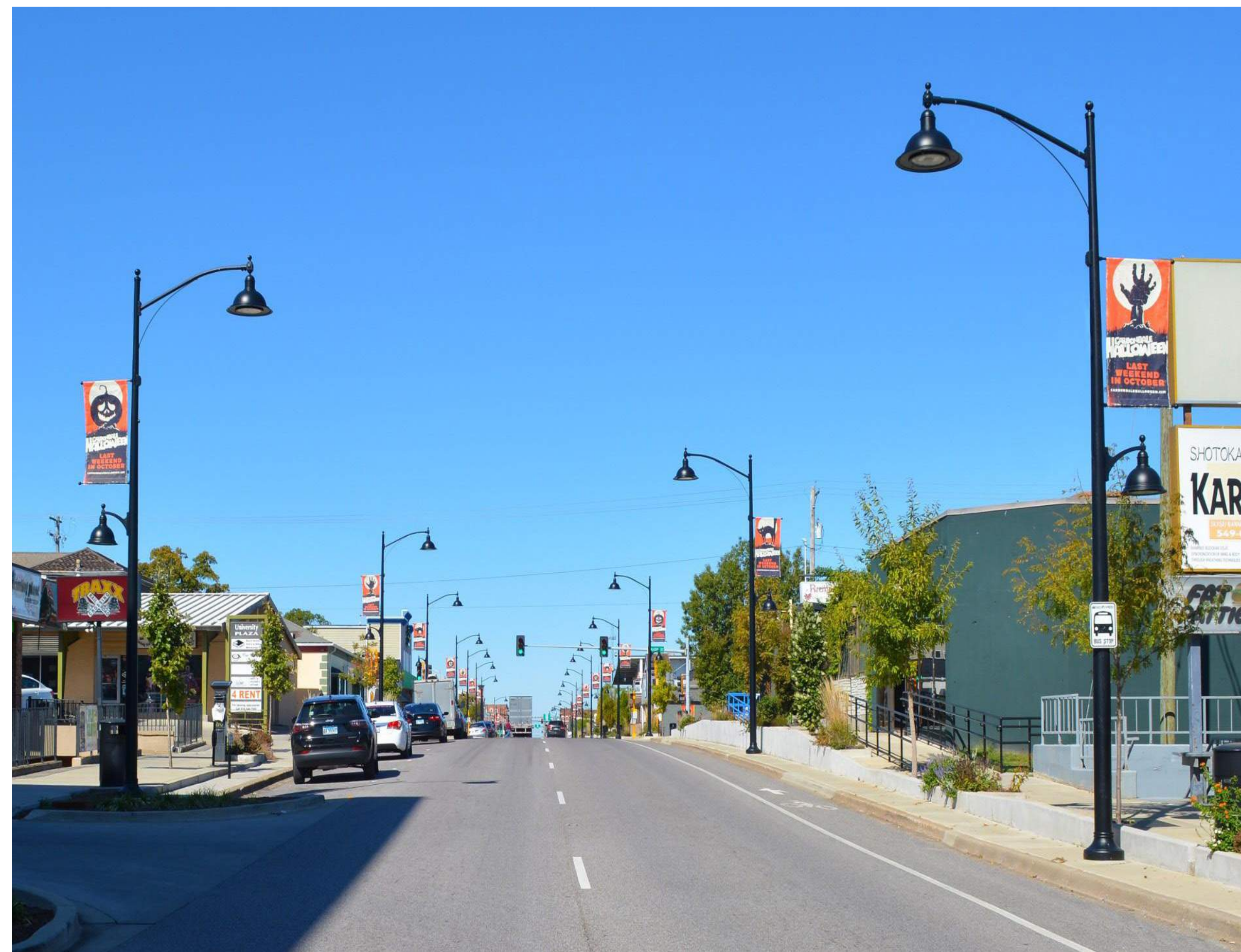
AESTHETIC ROADWAY LIGHTING WITH PEDESTRIAN LEVEL FIXTURES & BANNERS