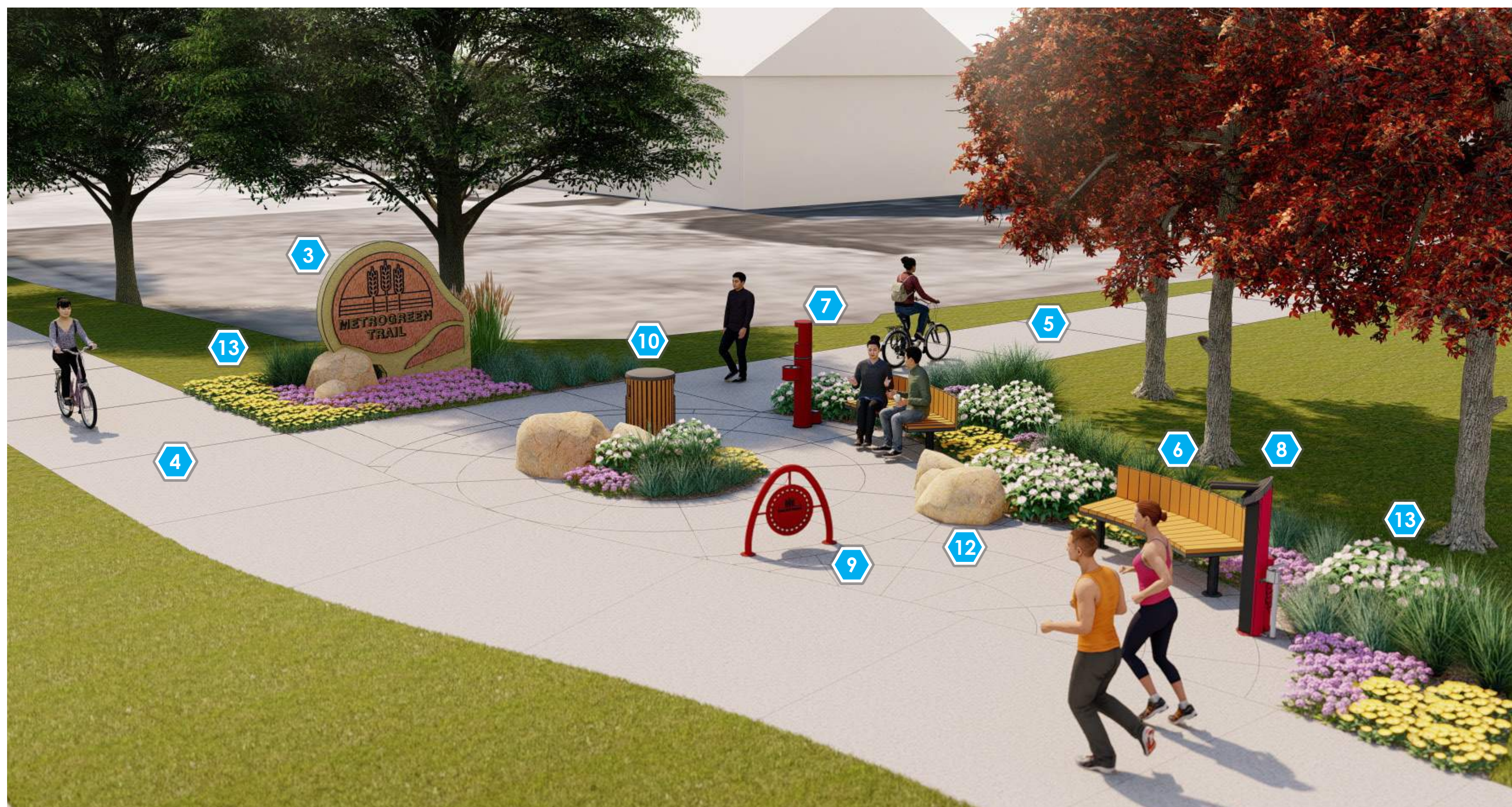
METROGREEN TRAIL HEAD AT 155TH STREET