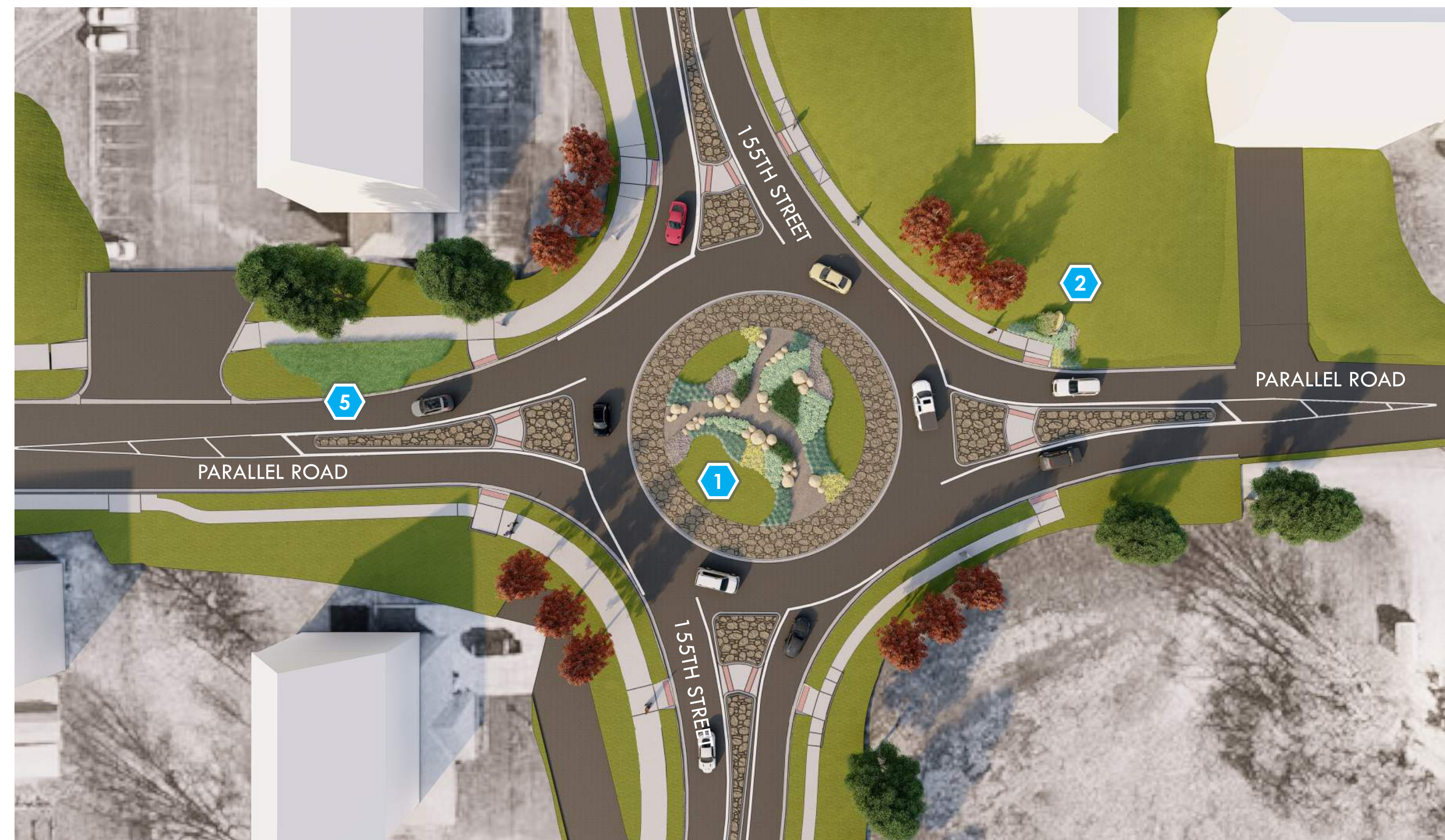
PLAN VIEW OF ROUNDABOUT WITH DRY CREEK BED