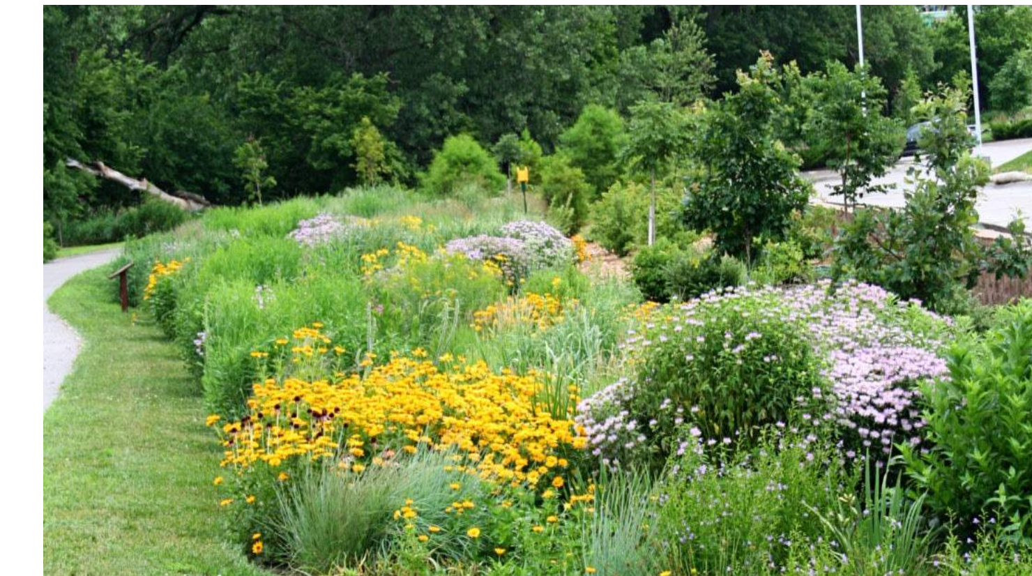
NATIVE GRASSES & WILDFLOWERS