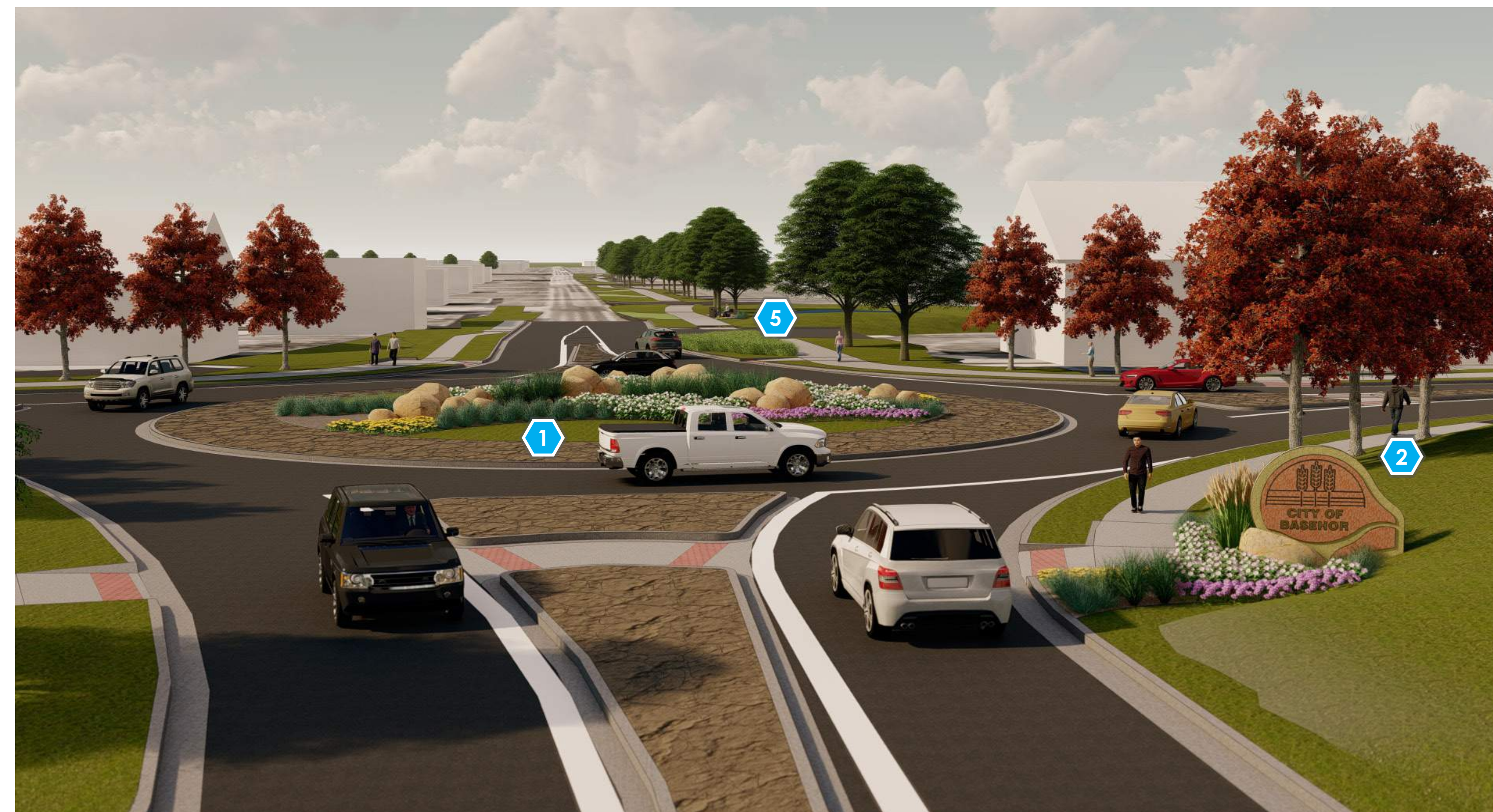
VIEW OF ROUNDABOUT LOOKING WEST ON PARALLEL ROAD