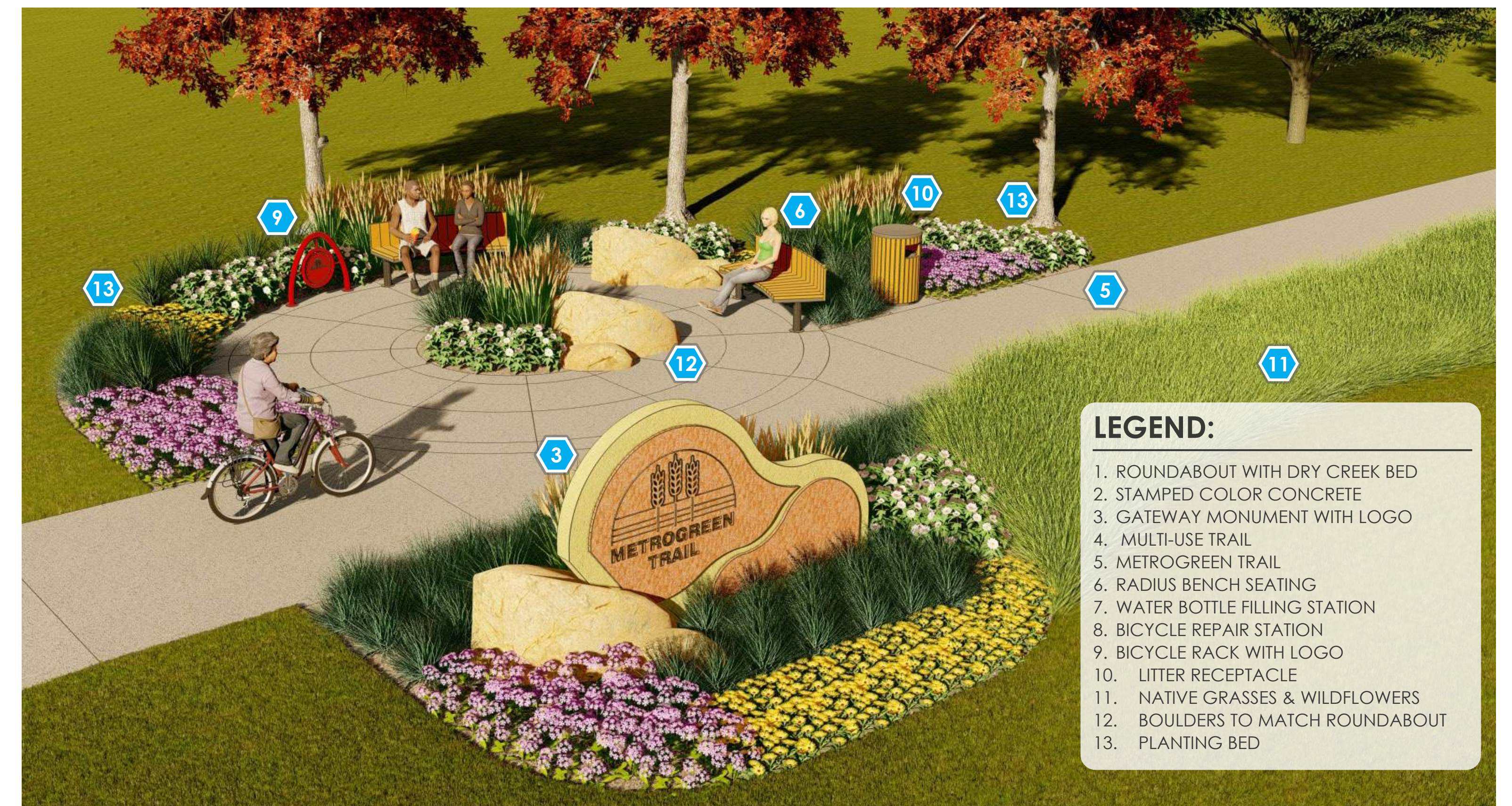
METROGREEN TRAIL HEAD AT 158TH STREET