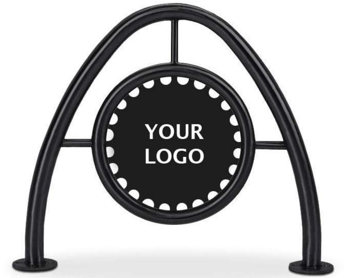
CUSTOMIZED BIKE RACK