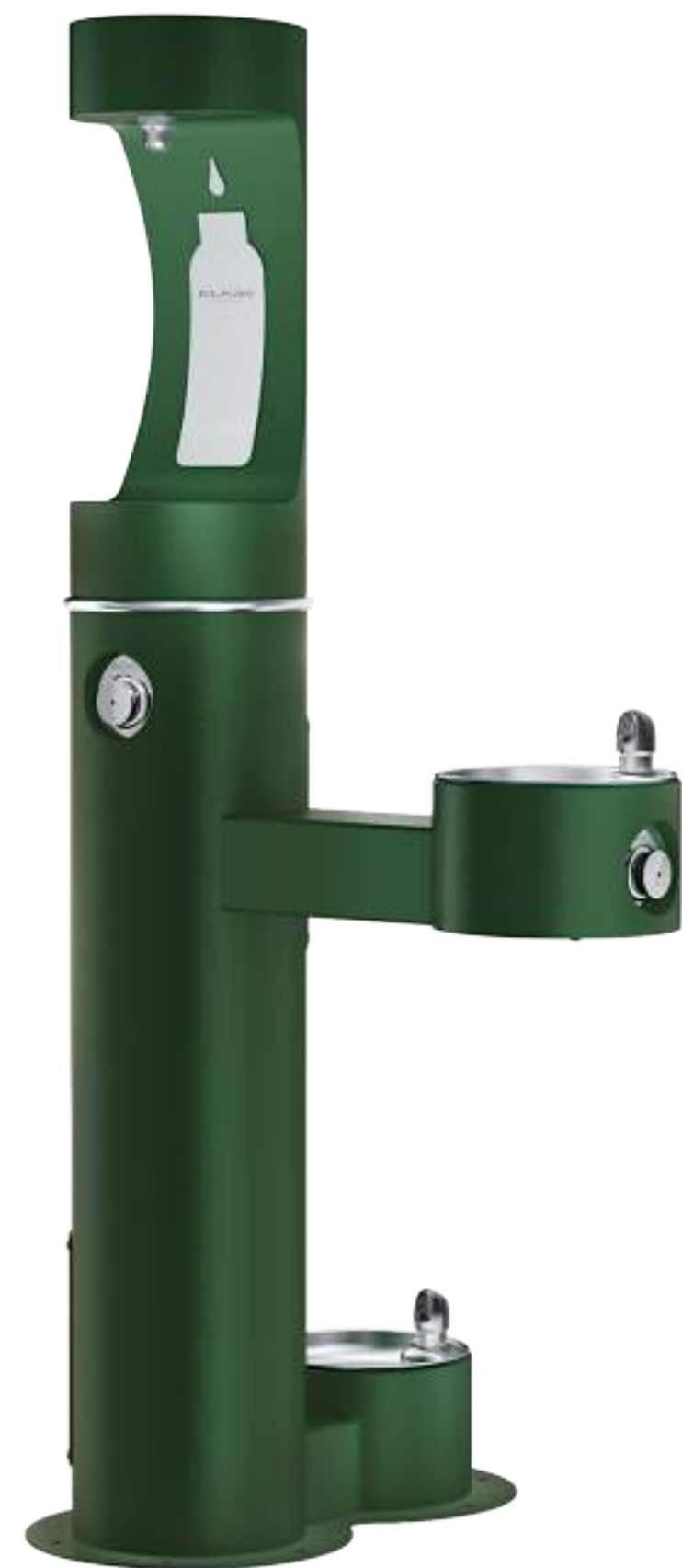
WATER BOTTLE FILLING STATION